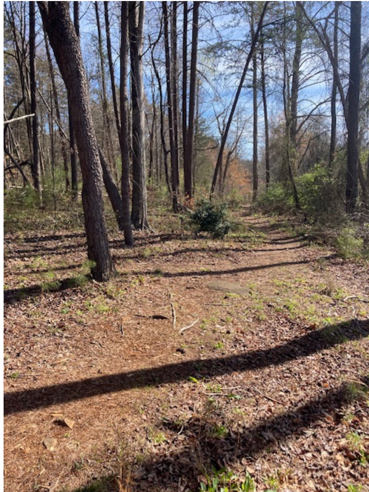
Bethabara Wetlands Trail looking bird and hiker friendly after clean-up